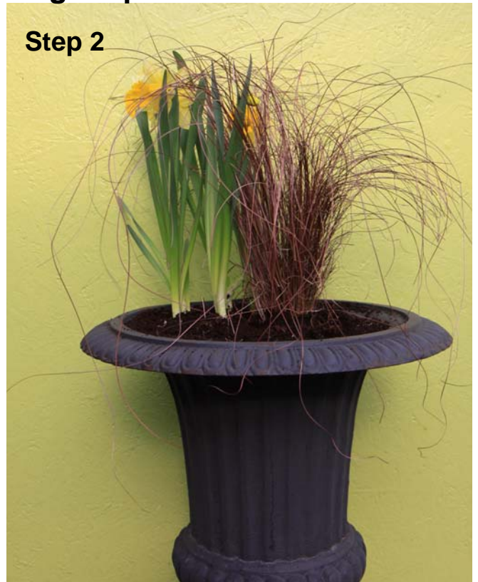
Step 2. Add the tallest plants towards the center of the container.