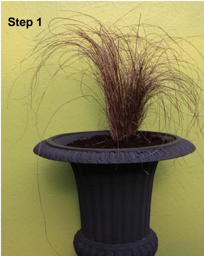
Step 1. Create a focal point with height.