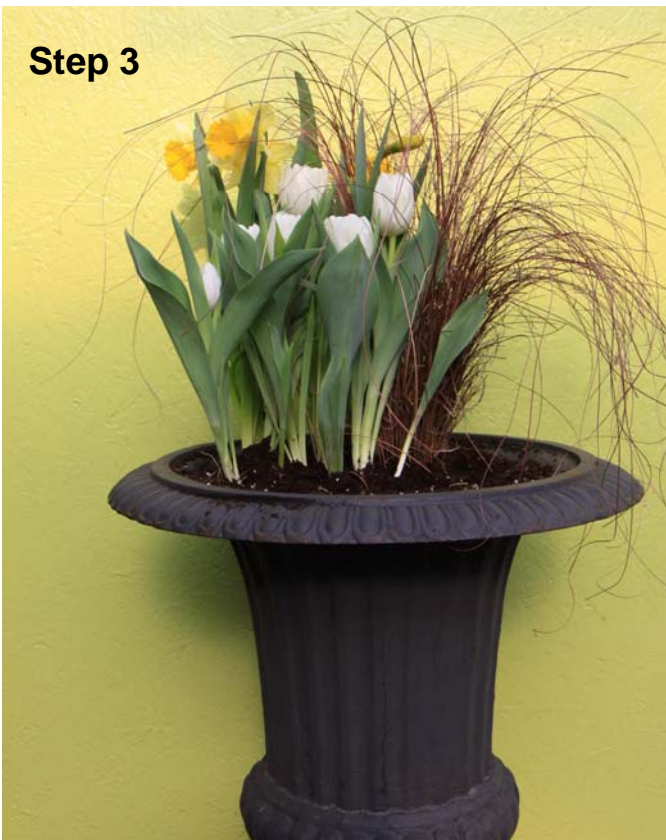
Step 3. Combine tulips with daffodils for colour and varied bloom times.